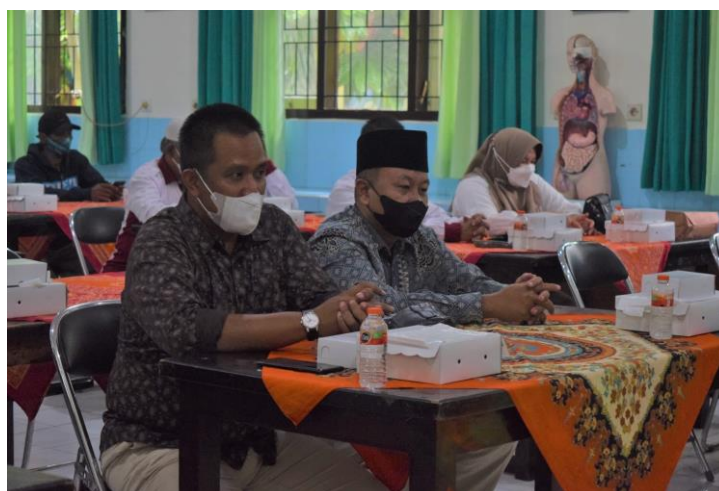
Picture 1. Community engagement program